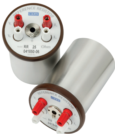
Model CER6000-RR reference resistor with different resistance range